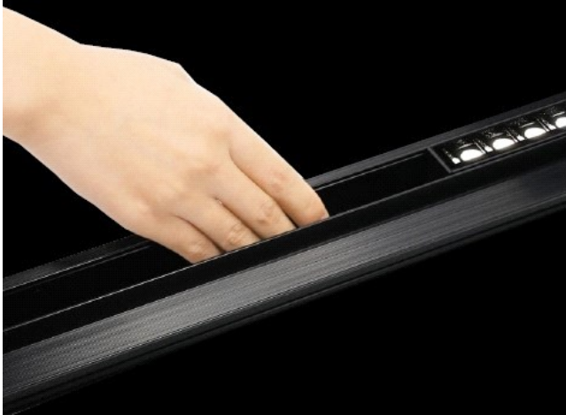
20mm Magnetic Track Lighting System