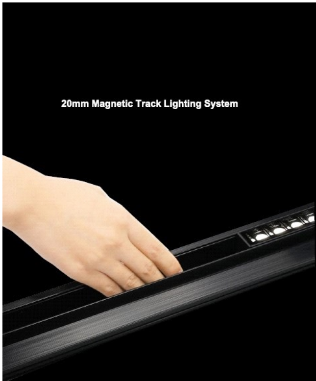
20mm Magnetic Track Lighting System