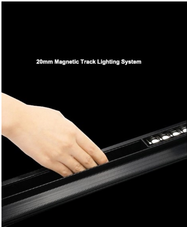
20mm Magnetic Track Lighting System