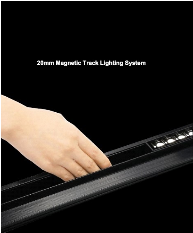
20mm Magnetic Track Lighting System