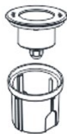
Recessed with sleeve