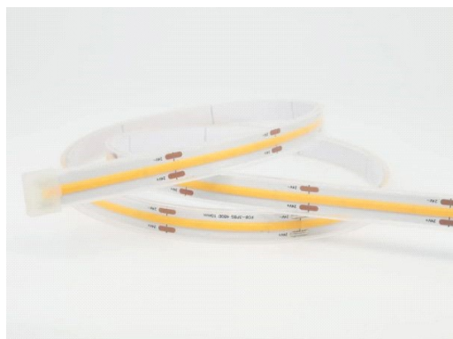
OUTDOOR480-COB-P (8mm) IP65.png